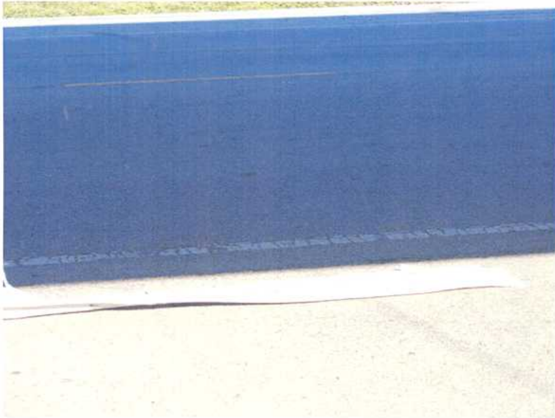
Photo # 5 Direction E Comments: VINYL SIDING WHICH FELL TO THE GROUND WHILE DRIVER WAS TAPPING TRAILER, LICENSE # 159493 ST