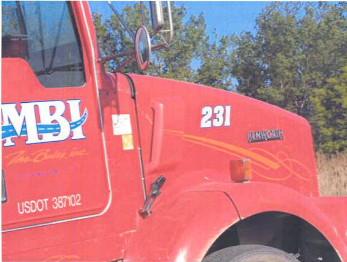
Photo # 2 Direction SE Comments: TRUCK # of UNHAPPY TRAILER, LICENSE # 159193 ST

Time: 5:15-7 PM Inspector: Roseman County: Cook