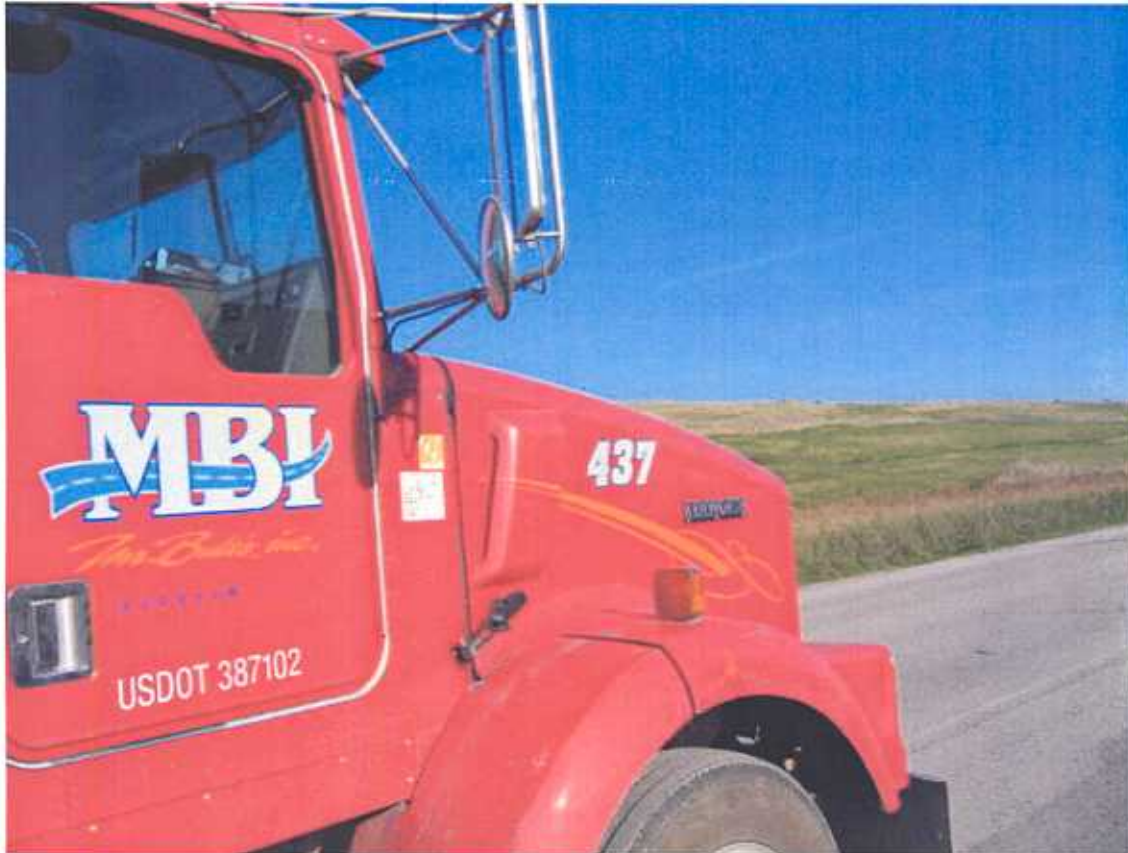
Photo # 9 Direction SE Comments: TRUCK # 437, HAULING TRAILER # 830, LICENSE # 228 KH ST

Time: 5:15-7 PM Inspector: Roseman County: Cook