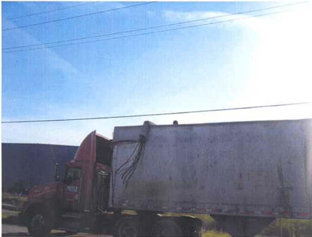
Photo # 10 Direction SW Comments: DRIVER TAPPING TRAILER # 830, LICENSE # 228 144 ST