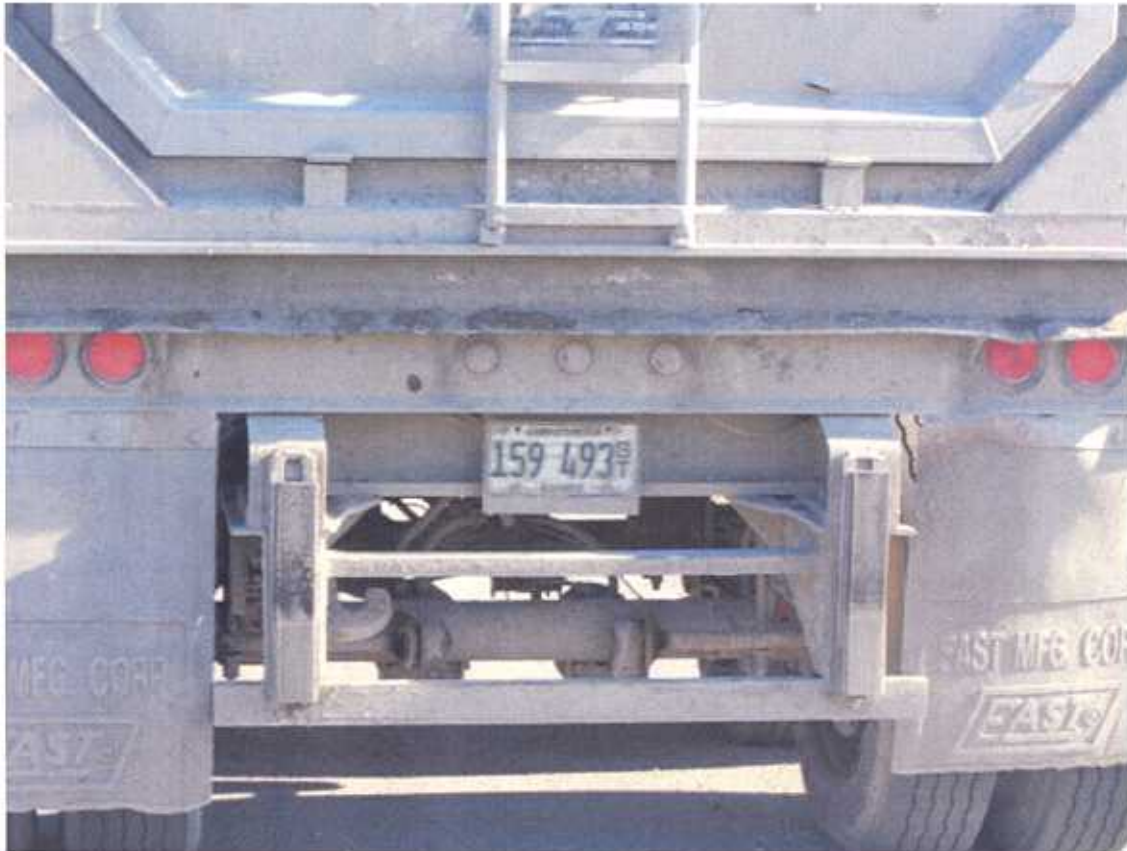
Photo # 1 Direction S Comments: License plate of TRAILER (w/o #) untagged on the public WAY

Time: 5:15-7 PM Inspector: Roseman County: Cook