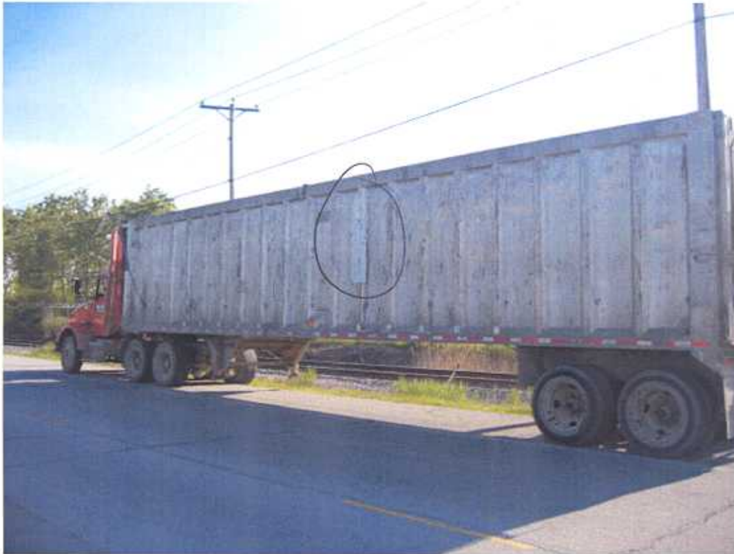
Photo # 3 Direction SW Comments: VINYL SIDING MISSING FROM UNSTAPPED TRAILER, LICENSE # 159 493 ST

Time: 5:15-7 PM Inspector: Roseman County: Cook