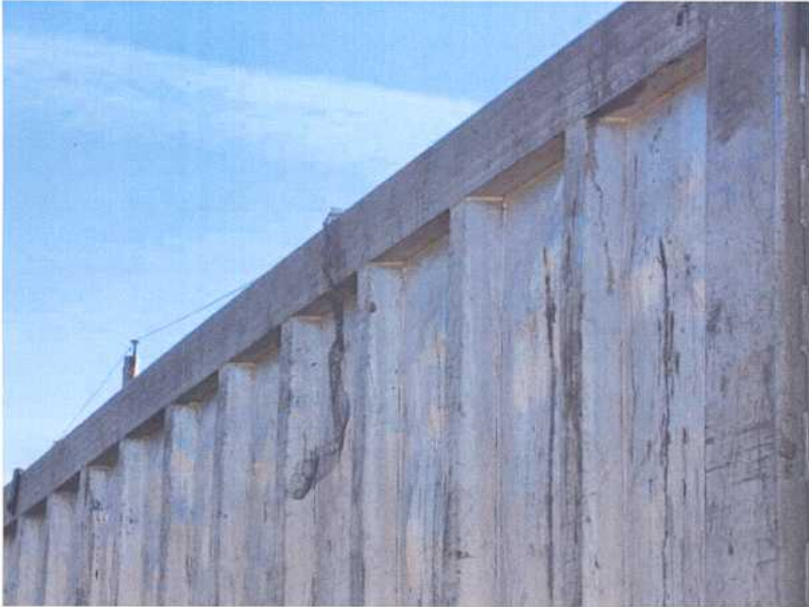
Photo # 12 Direction SE Comments: litter hanging from top of trailer # 631, license # 199 969 ST

Time: 5:15-7 PM Inspector: Roseman County: Cook