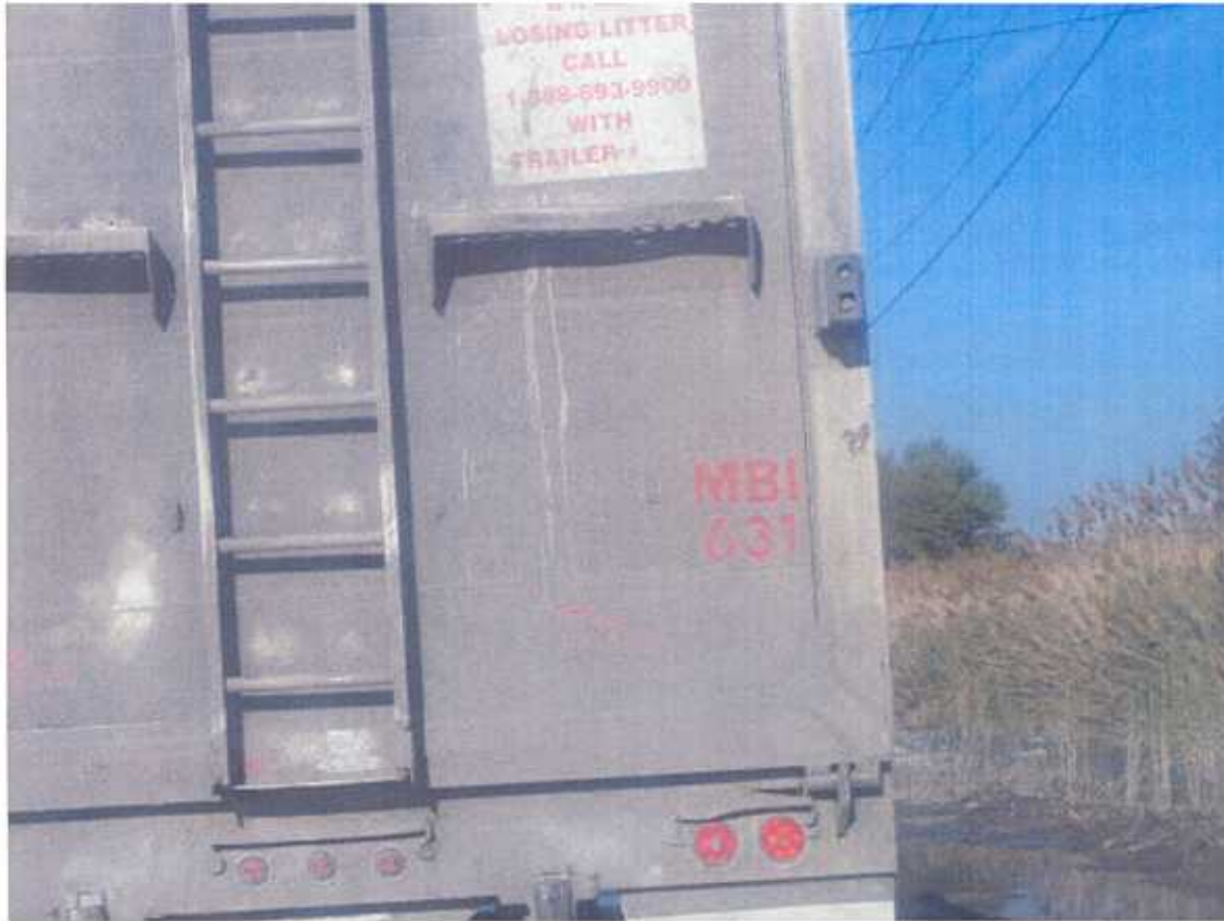
Photo # 13 Direction E Comments: TRAILER # 631, LICENSE # 19996A ST

Time: 5:15-7 PM Inspector: Roseman County: Cook