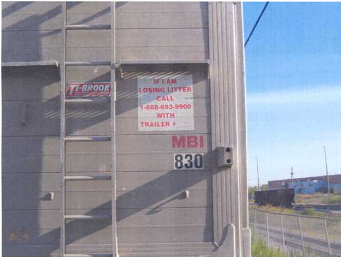
Photo # 7 Direction S Comments: TRAILER # 830, license # 228 K4 ST

Time: 5:15-7 PM Inspector: Roseman County: Cook